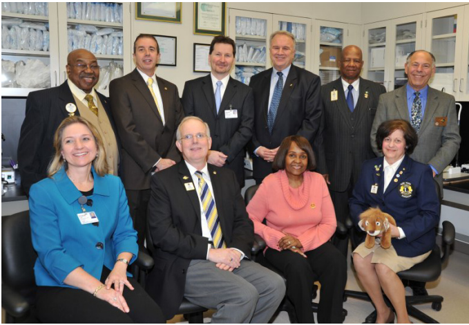
Members of the Eye Bank Board and other dignitaries in the Eye Bank's new home at Franklin Hospital in Valley Stream.